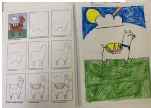
Amazon, Grade 4