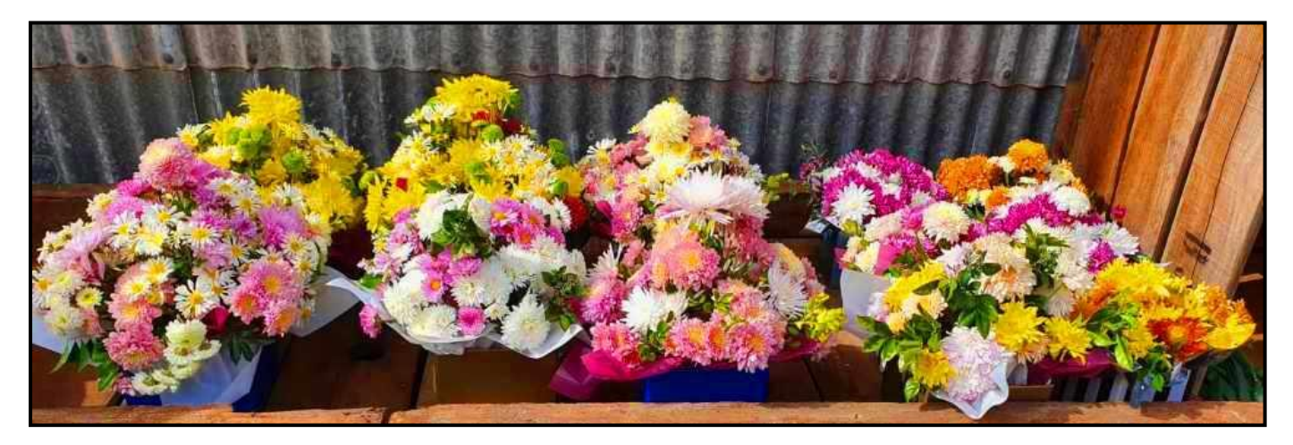
At Kersbrook Primary School we value Respect, Responsibility, Confidence and Resilience

We thank everyone for their support and remember to support local small businesses. We really need it and appreciate it. From the team at JAMES Orchards, we thank you.